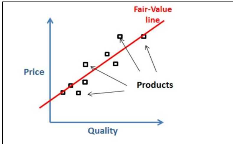
Figure 1- Price Quality Graph