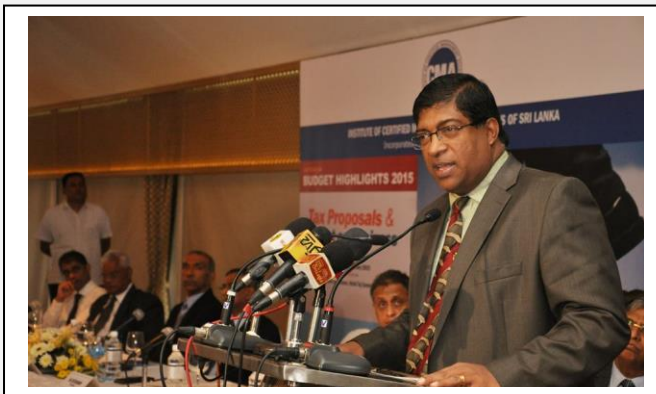
Minister of Finance , Hon Ravi Karunanayake addressing the Budget Seminar