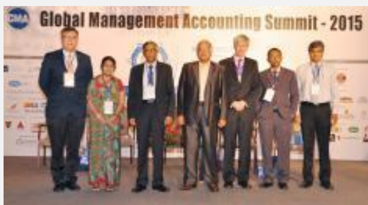
The Panel of judges of the Integrated Report Awards.