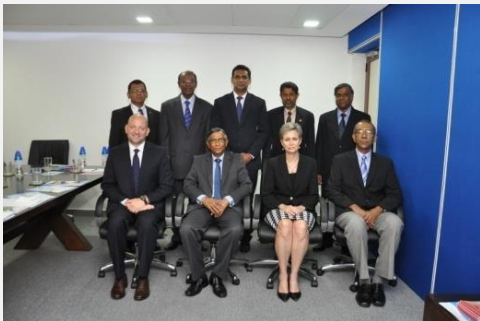
Governing Council with President of IFAC